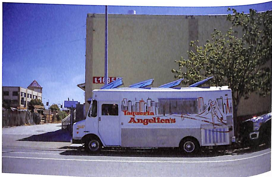
INDIANA ST. & CESAR CHAVEZ, SAN FRANCISCO