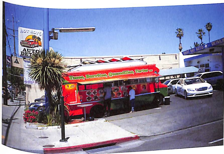
THIRTY-SIXTH AVE. & FOOTHILL BLVD., OAKLAND