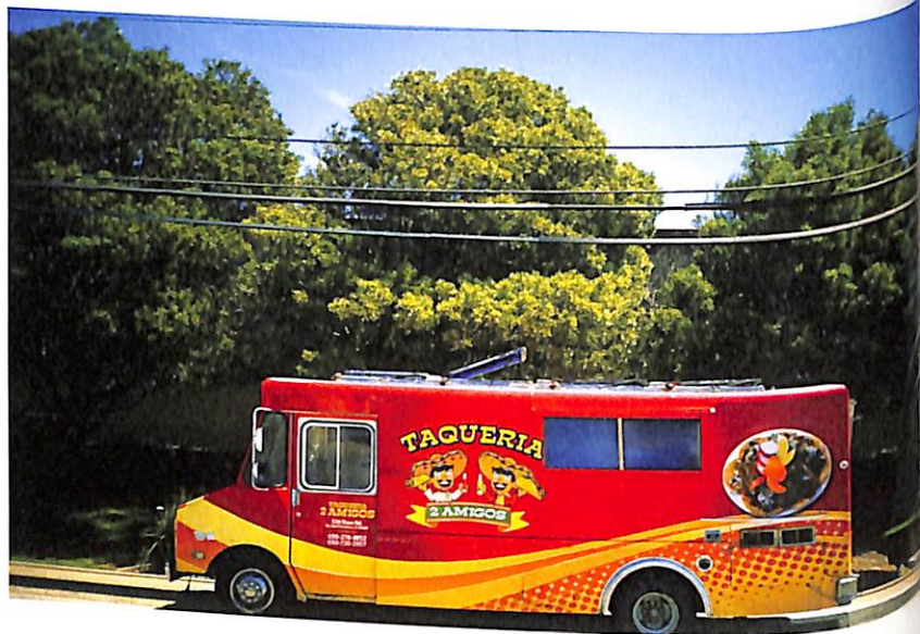
LITTLEFIELD AVE. & E. GRAND AVE., SOUTH SAN FRANCISCO