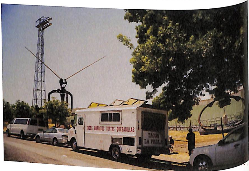
POPLAR ST. & W. GRAND AVE., OAKLAND