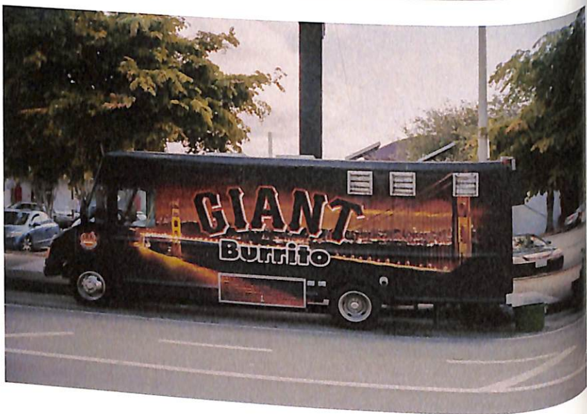
BAYSHORE BLVD. & OAKDALE AVE., SAN FRANCISCO