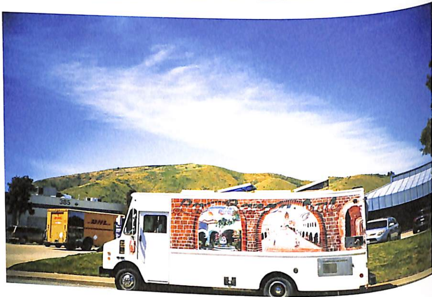
OYSTER POINT BLVD. & MARINA BLVD., SOUTH SAN FRANCISCO