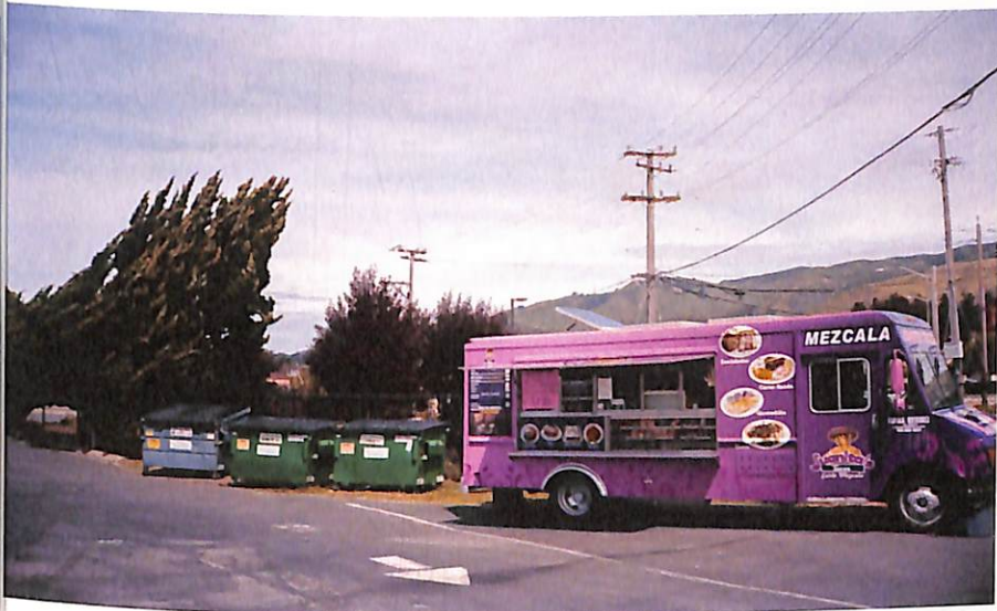
EL CAMINO REAL & CHESTNUT AVE., SOUTH SAN FRANCISCO