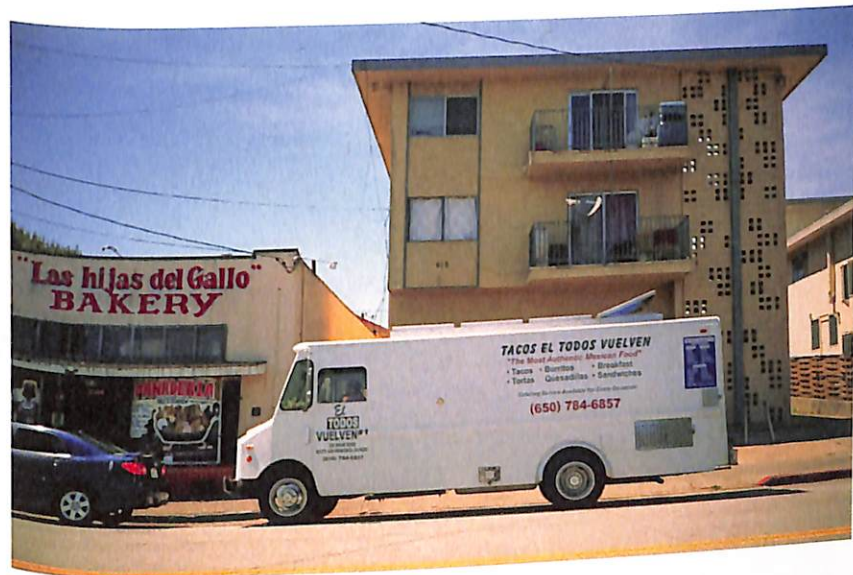
LINDEN AVE. & PINE ST., SOUTH SAN FRANCISCO