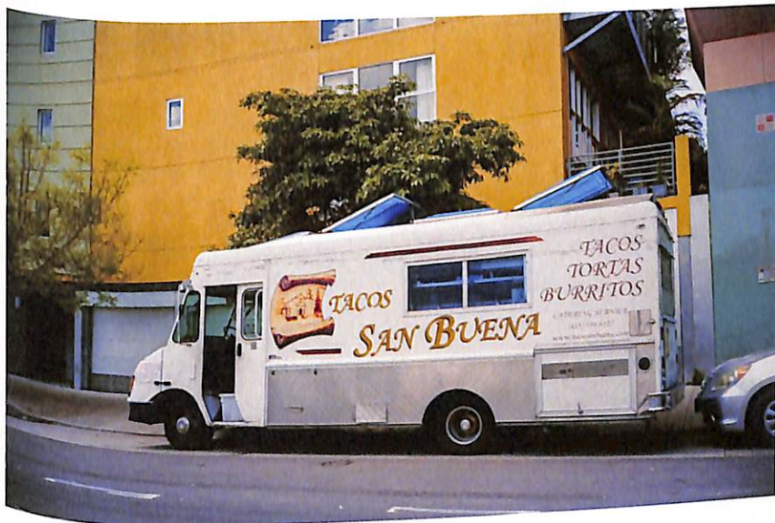
TWENTY-SECOND ST. & HARRISON ST., SAN FRANCISCO