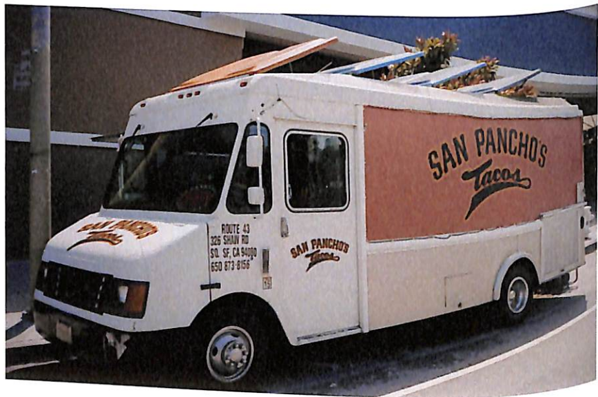
BAYSHORE BLVD. & CORTLAND ST., SAN FRANCISCO