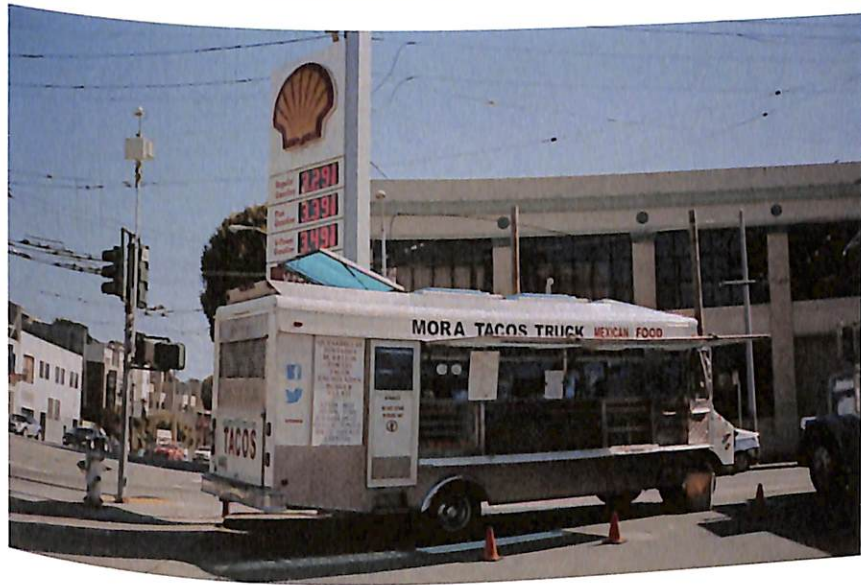
MARIPOSA ST. & POTRERO AVE. SAN FRANCISCO