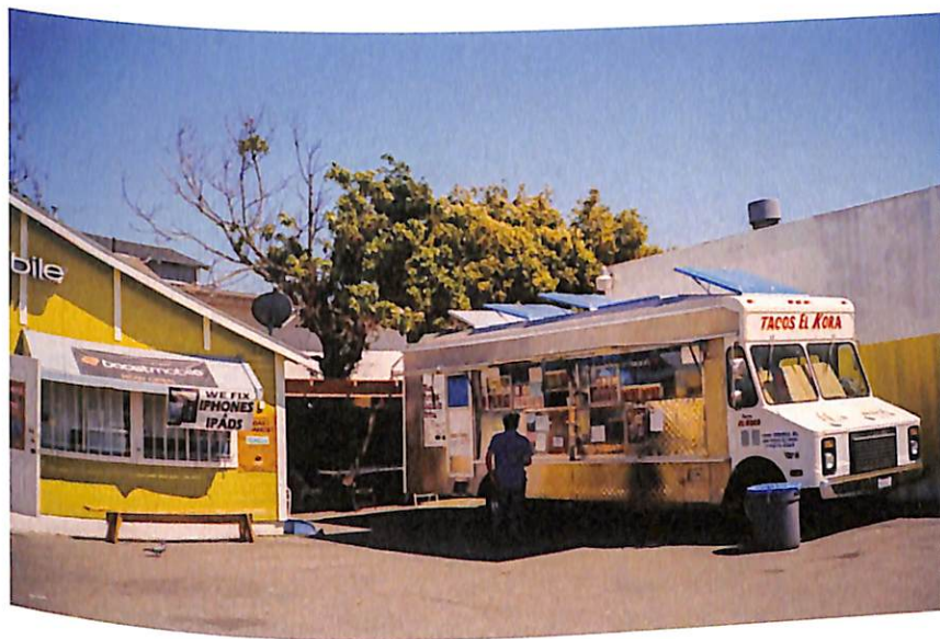
TWENTY-THIRD ST. & GRANT AVE., RICHMOND