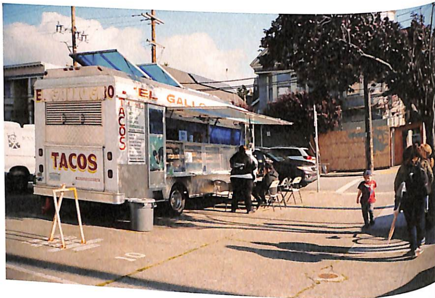
TWENTY-THIRD ST. & TREAT AVE., SAN FRANCISCO