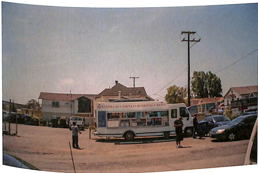
FIFTH ST. & CENTER ST., OAKLAND