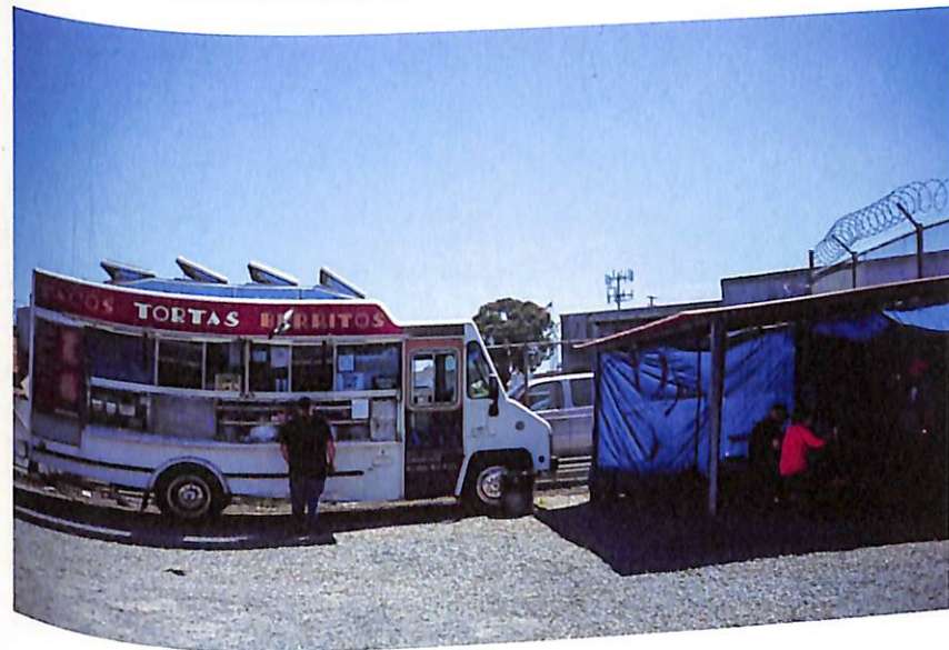
HIGH ST. & COLISEUM WAY, OAKLAND