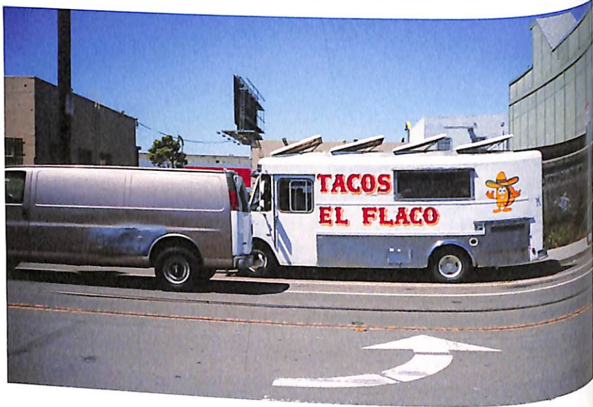
TWENTY-FIFTH ST. & ILLINOIS ST., SAN FRANCISCO