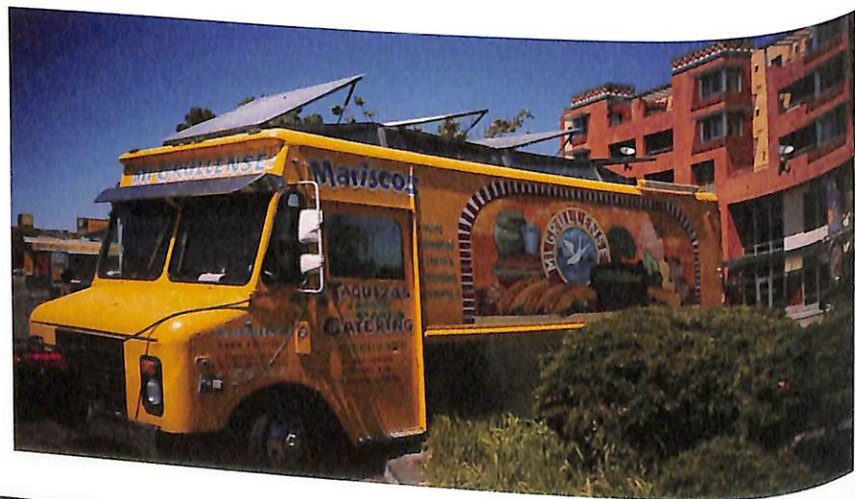
TWENTY-NINTH AVE. & INTERNATIONAL BLVD., OAKLAND