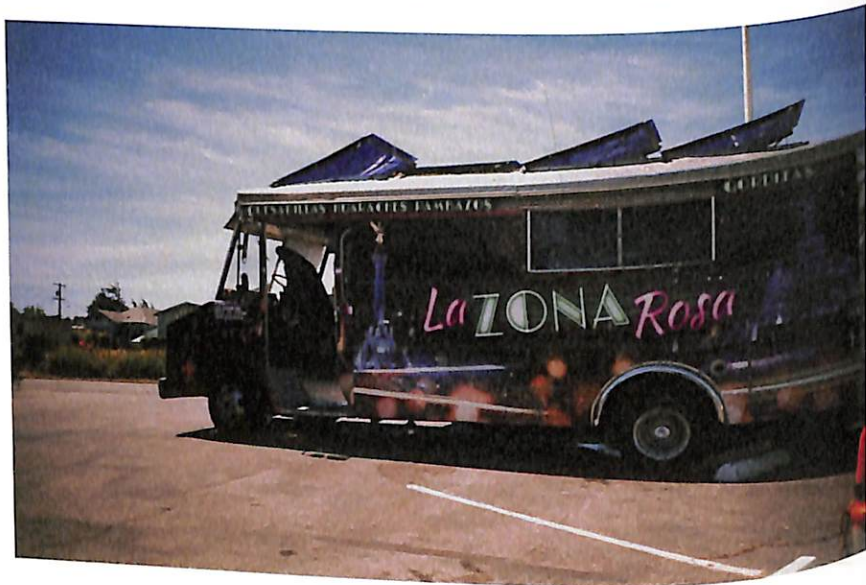
EL CAMINO REAL & CHAPMAN AVE., SAN BRUNO