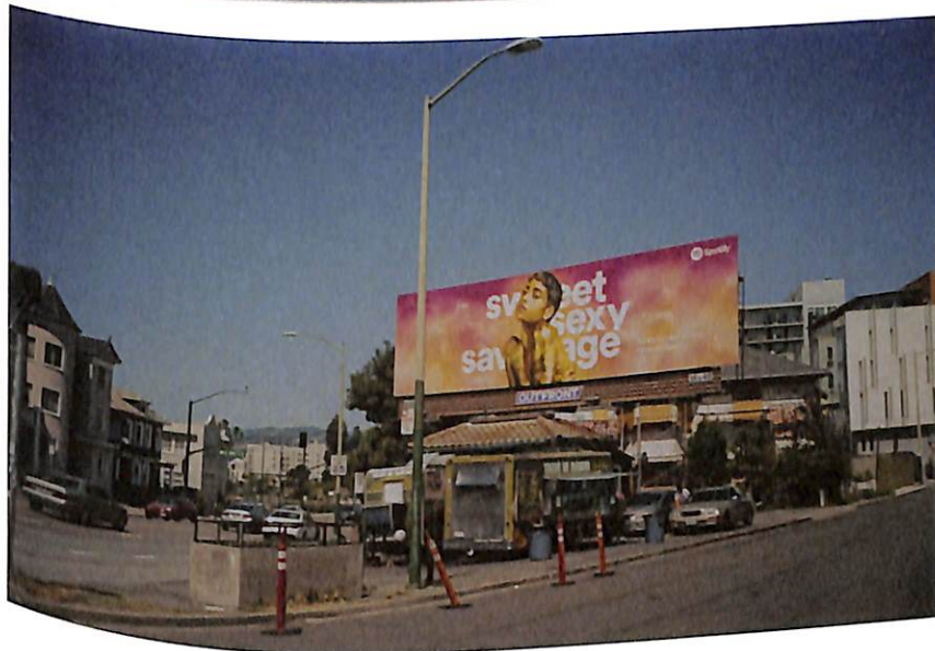
FIRST AVE. & INTERNATIONAL BLVD., OAKLAND