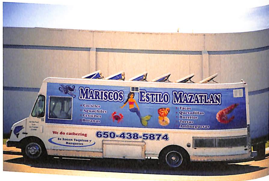
E. GRAND AVE. & DNA WAY, SOUTH SAN FRANCISCO