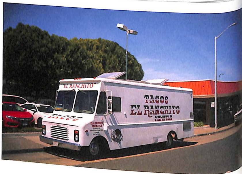
EL CAMINO REAL & JENEVEIN AVE., SAN BRUNO