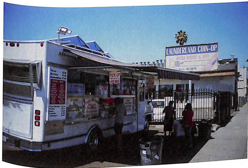
FOOTHILL BLVD. & FORTY-FIRST. AVE., OAKLAND