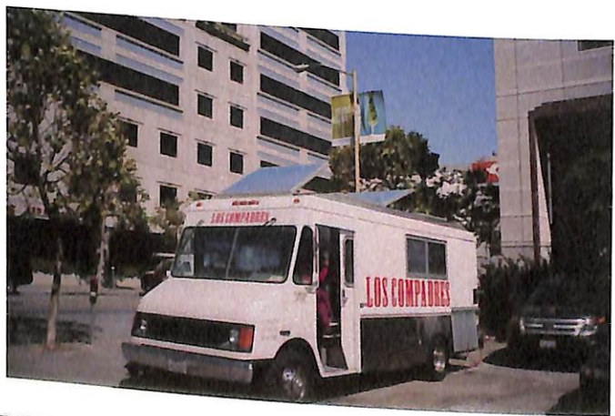
THIRD ST. & HARRISON ST., SAN FRANCISCO