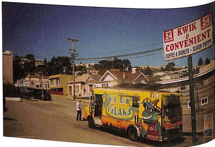
MONTEREY BLVD. & FOERSTER ST., SAN FRANCISCO