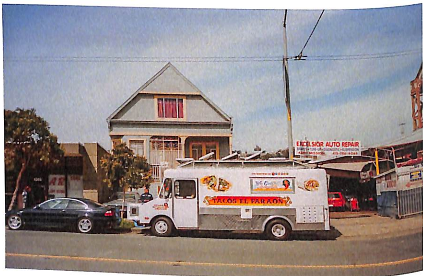
MISSION ST. & THERESA ST., SAN FRANCISCO