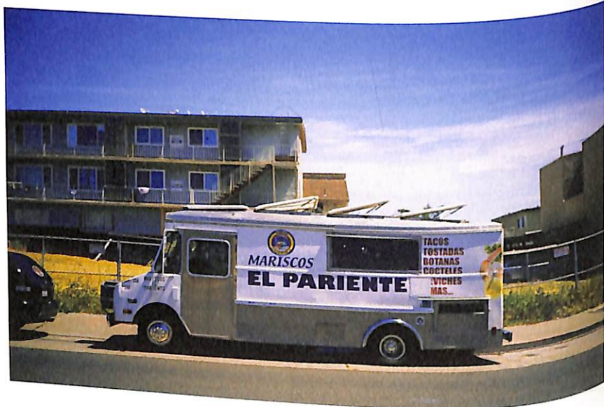
EL CAMINO REAL & SAN LUIS AVE., SAN BRUNO