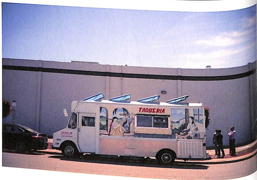
UTAH AVE. & S. AIRPORT BLVD., SOUTH SAN FRANCISCO