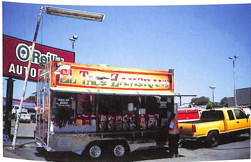
HIGH ST. & INTERNATIONAL BLVD., OAKLAND