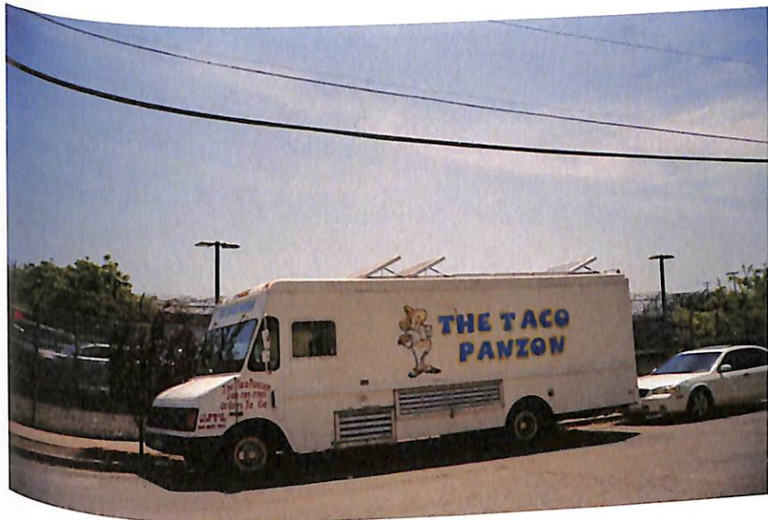
CAMPBELL ST. & W. GRAND AVE., OAKLAND