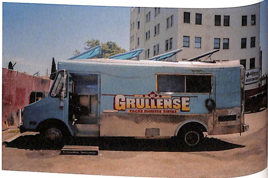
INTERNATIONAL BLVD. & DERBY ST., OAKLAND