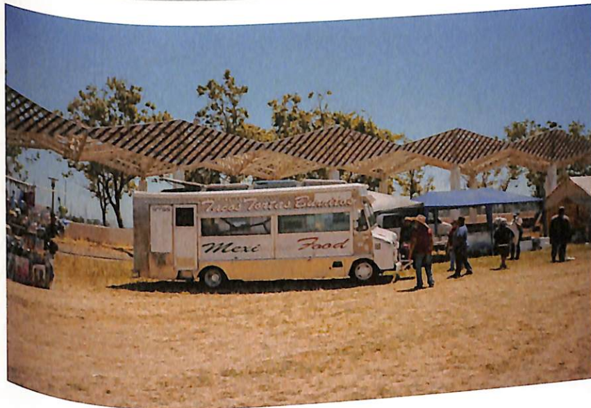
ESTUARY PARK - EMBARCADERO WEST, OAKLAND