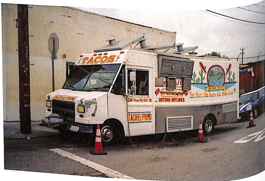
YOSEMITE AVE. & JENNINGS ST., SAN FRANCISCO