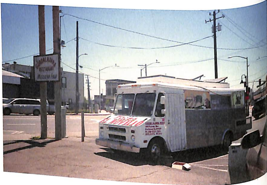
E. TENTH ST. & FRUITVALE AVE., OAKLAND