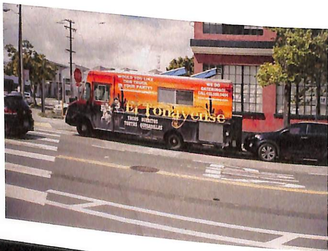
SEVENTEENTH ST. & HARRISON ST., SAN FRANCISCO