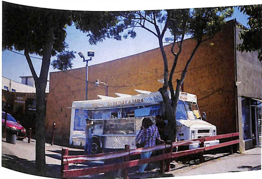
FORTY-FOURTH AVE. & INTERNATIONAL BLVD., OAKLAND