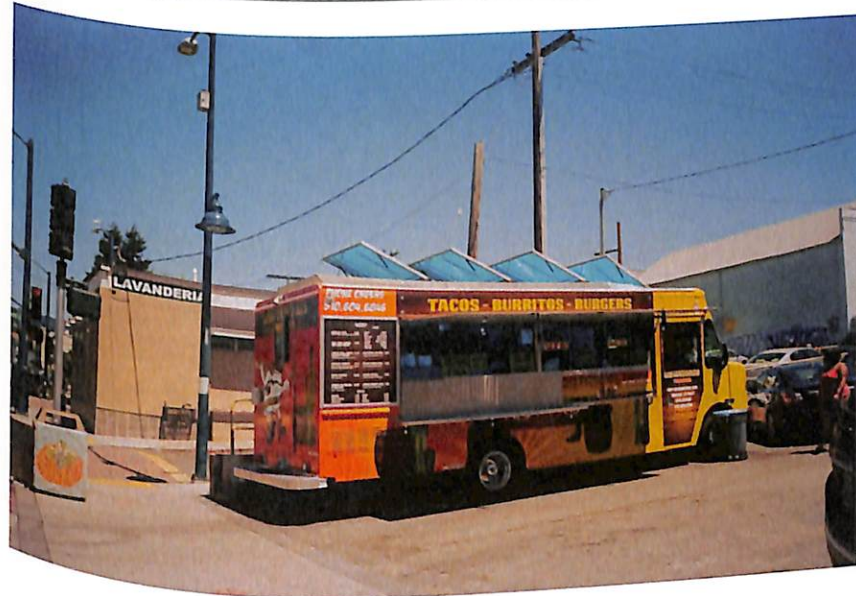
TWENTY-THIRD ST & Foothill BLVD., OAKLAND