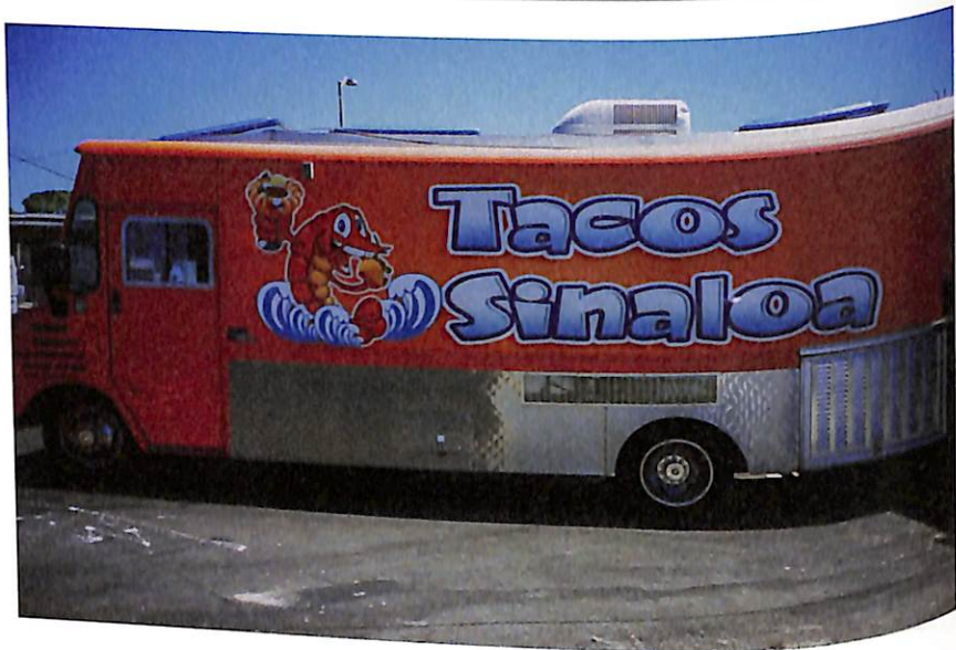
TWENTY-SECOND ST. & INTERNATIONAL BLVD., OAKLAND