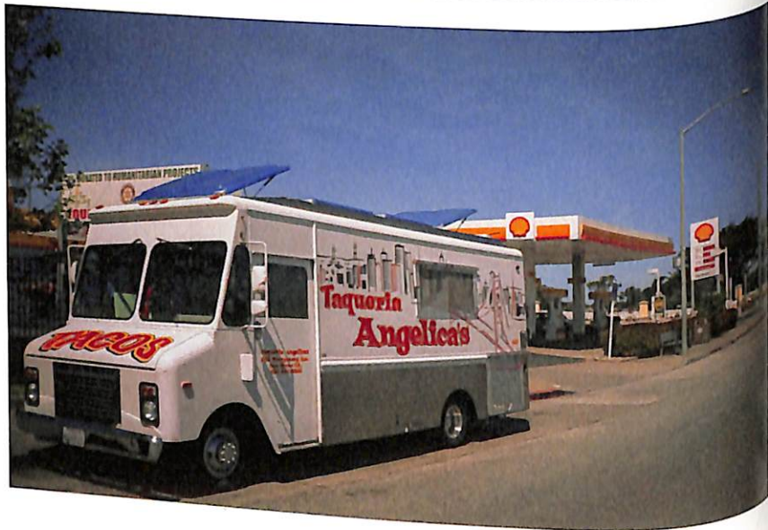
EL CAMINO REAL & SNEATH LN., SAN BRUNO