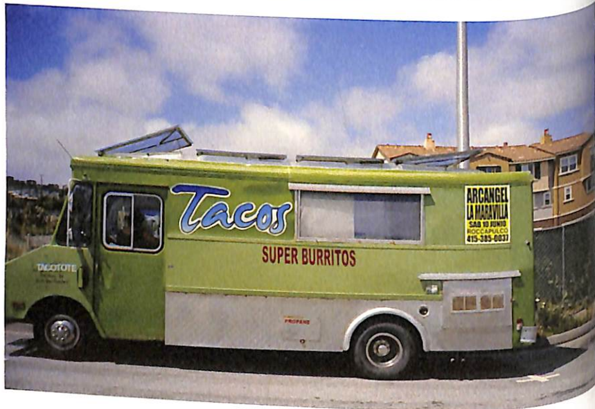
MCCLELLAN DR. & MISSION RD., SOUTH SAN FRANCISCO