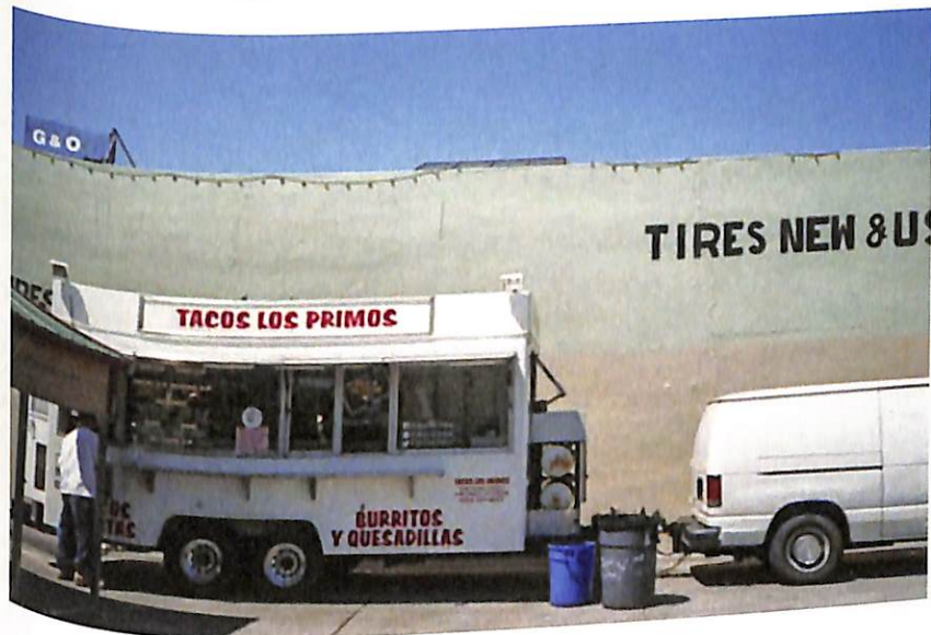
TWENTY-THIRD ST. & ROOSEVELT AVE., RICHMOND