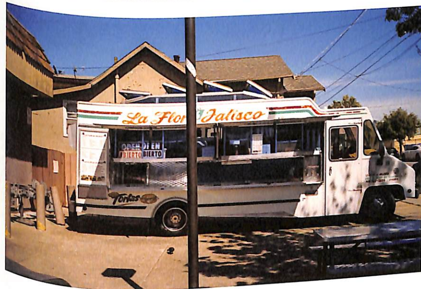
TWENTY-THIRD ST. & CLINTON AVE., RICHMOND